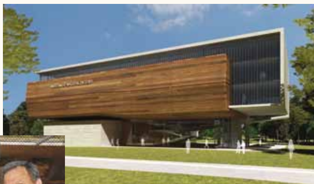
Architectural rendering of the Steinhardt National Collections of Natural History Building